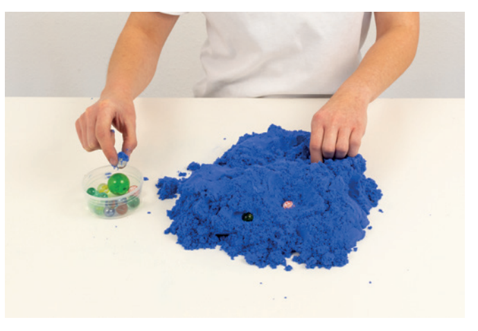
Finding marbles 02