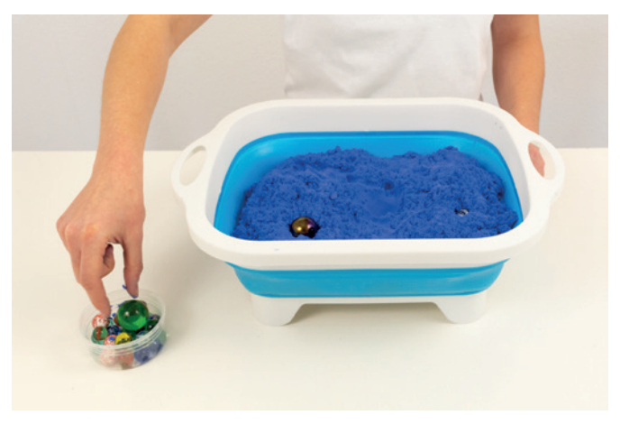
Find marbles with tub 02