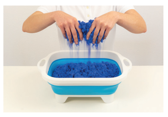
Sand trickle biliteral with tub 02