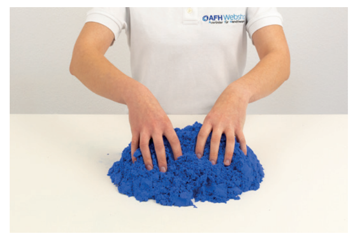
Sand trickles biliteral 01