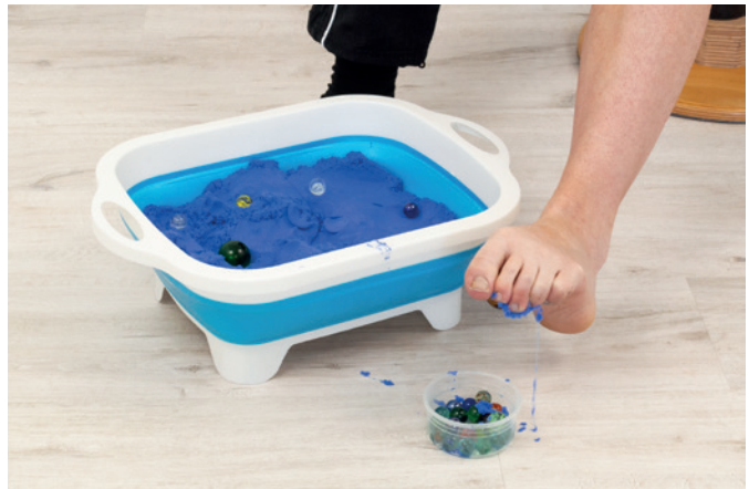
Finding marbles / grasping with toes 02