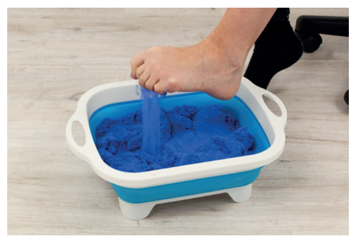
Sand trickling / gripping force with toes 02