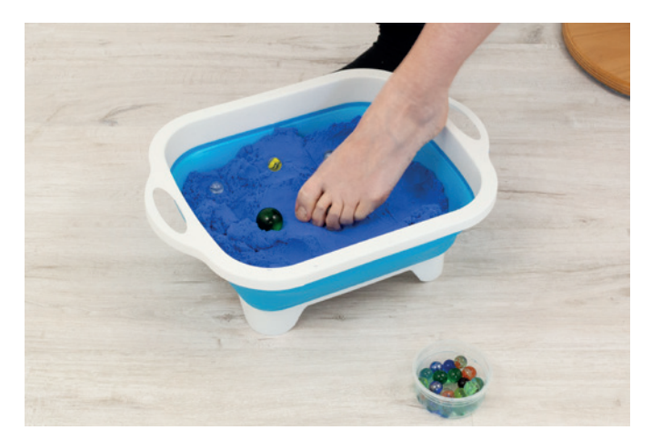
Finding marbles / grasping with toes 01