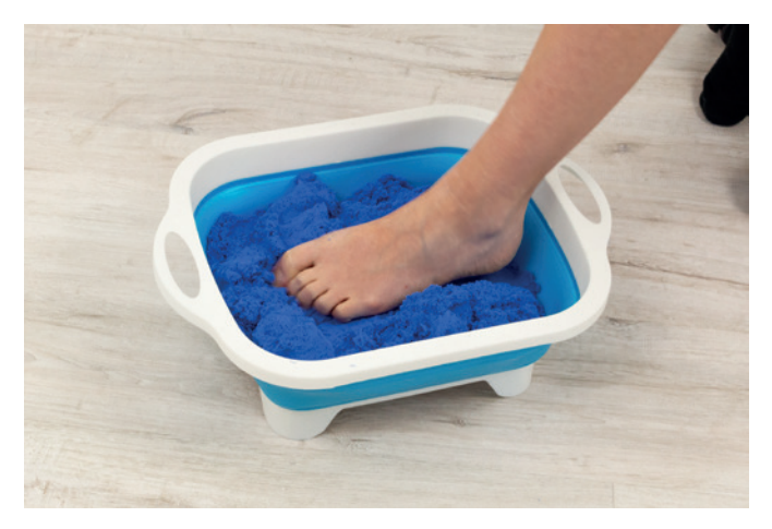
Sand trickling / gripping force with toes 01