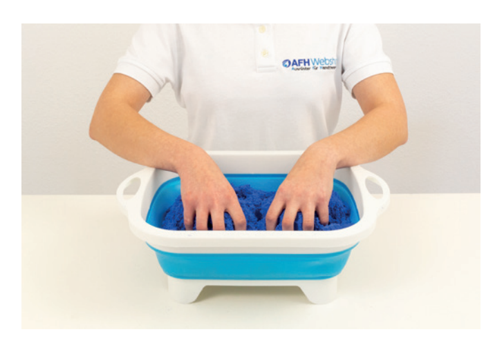
Sand trickle biliteral with tub 01

Further exercises are possible depending on the therapeutic instructions.