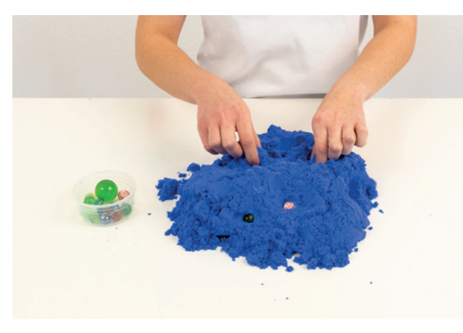
Finding marbles 01

Further exercises are possible depending on the therapeutic instructions.