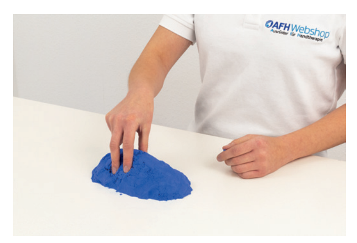
spherical grip 02