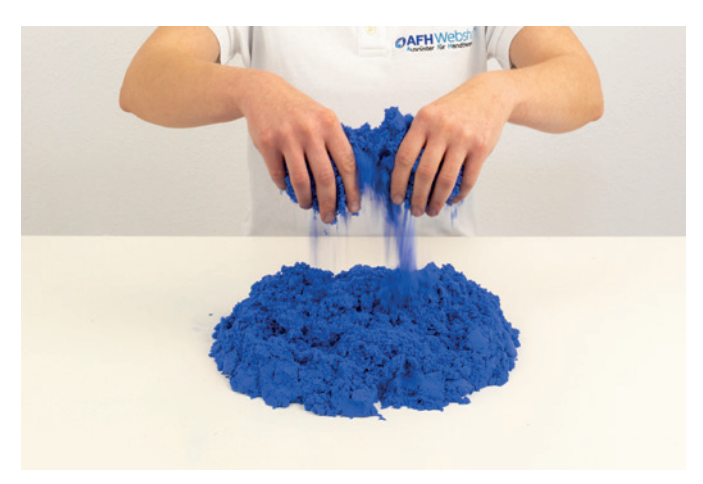
Sand trickles biliteral 02