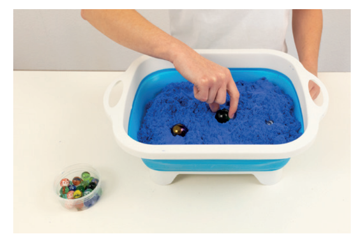
Find marbles with tub 01